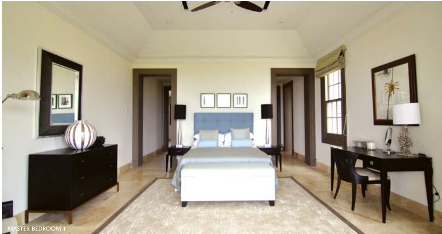
MASTER BEDROOM 1